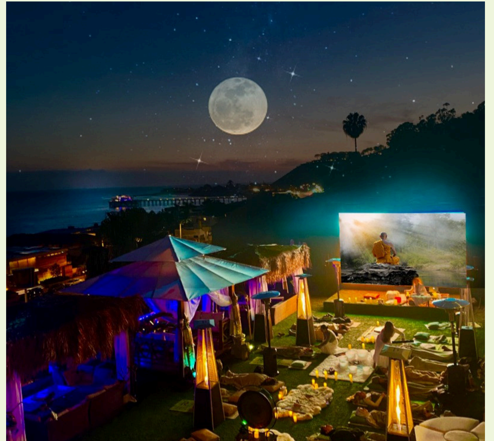
Rafi's Lounge, Malibu, CA

Join us for a naturally fragrant day of healing, performance, and rejuvenation in an environment designed to delight the senses and soothe the soul.